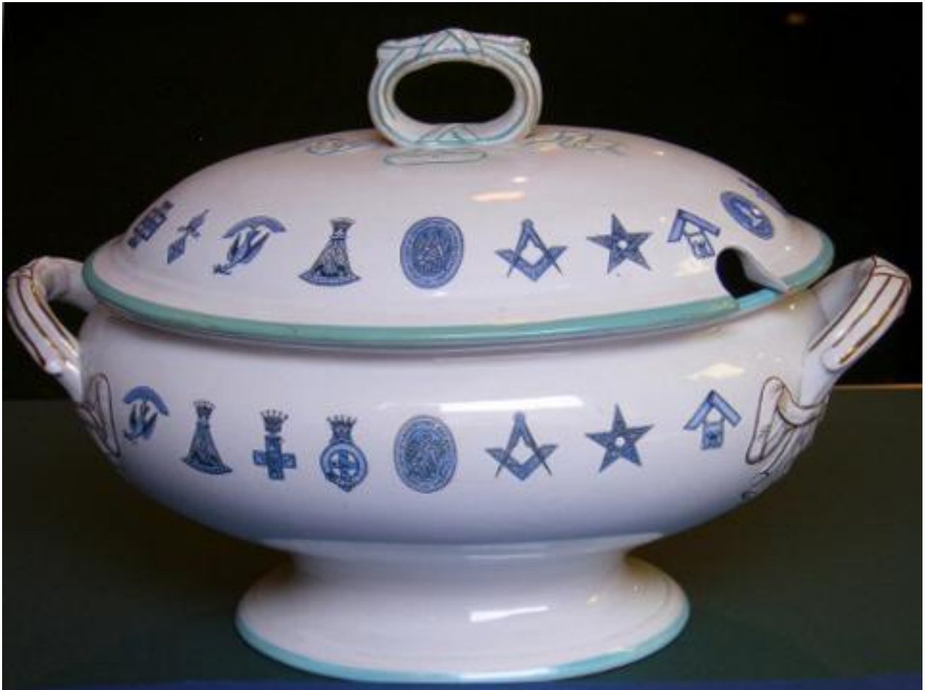
[Fig. 2] Belleek earthenware tureen, with printed Masonic motifs, part of the dinner service commissioned by the District Grand Lodge of Cambridgeshire, designed by R.W. Armstrong, registered 13 April 1878, Freemason Museum, Freemason Hall, Molesworth St Dublin, (photographed with the kind permission of R. Hayes, curator of Freemason Museum).

Examples of a third style of Masonic tableware can be found in the United Grand Lodge of England's Collection and the Belleek Pottery Museum. A teacup is decorated with an engraved design of the Red Cross of Constantine that represents one of the Masonic side orders practiced under the English Constitution and established formally in England in 1865 (Royle, Museum of Freemasonry London, 08/07/09). Although the cup bears the Belleek mark, it does not bear the patent mark, and so it may have been manufactured after 1883 when such marks ceased to be used (Royle, Museum of Freemasonry London, 10/07/09). It was acquired by the Grand Lodge some time prior to 1938. A teacup, a dinner plate and a small bowl decorated with the same motifs, most likely commissioned by the same Masonic order, appear in the Belleek Museum.