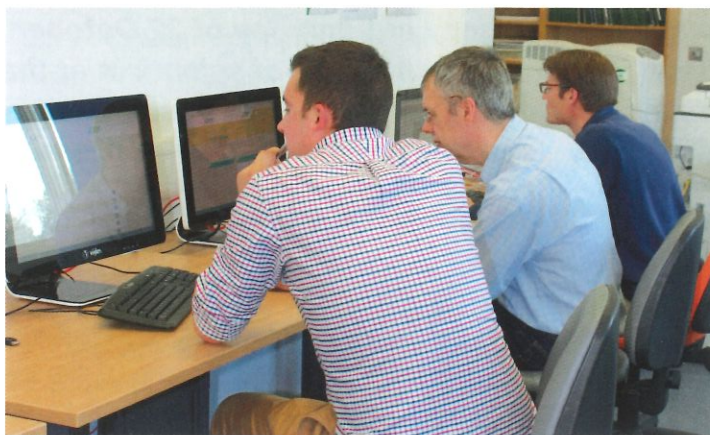
Above and below: Growers were given an interactive demonstration of the system at the event, which saw them try it out for themselves by inputting their own data into a computer.

team has developed a new, user-friendly decision-support system that can help them to control strawberry powdery mildew with fewer fungicide applications. The web-based system has steadily been in development since 2003/4, when the team first started plotting the number of disease-conducive hours that allow the