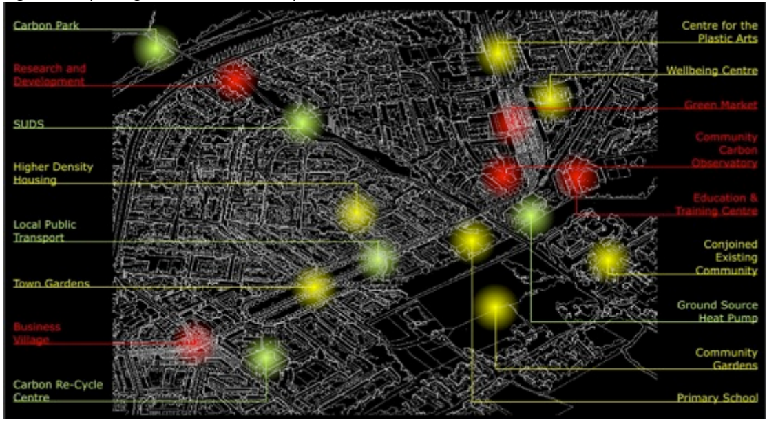
Figure 3: Exploring an eco town development

Mr Lock also discussed some masterplanned sustainable urban extensions designed by his firm that expressed some of the principles applying to eco towns, including the 6,500 home Rugby Radio Station, the ex-airfield of Alconbury Weald in Huntingdonshire with 6,000 homes and 9,000 jobs proposed, and closer to home Birchall Garden Suburb designed for the edge of Welwyn Garden City in a former tip area.