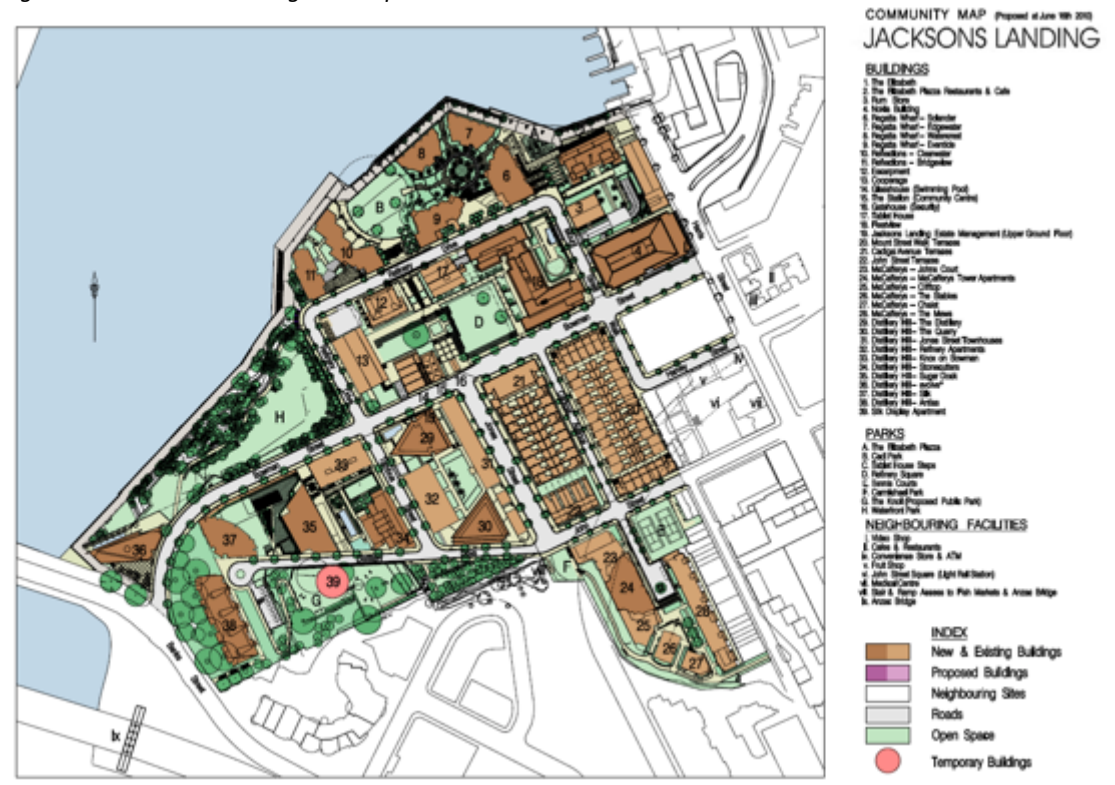
Figure 6 - Jackson's Landing Masterplan

In Park Central Dr Jones conducted 13 one-to-one interviews, 5 paired interviews, 1 focus group of 8 residents, while observations conducted over multiple site visits. In Jackson's Landing Dr Jones completed 15 one-to-one interviews, 3 paired interviews, 1 focus group (6 residents and again observations conducted over multiple site visits.