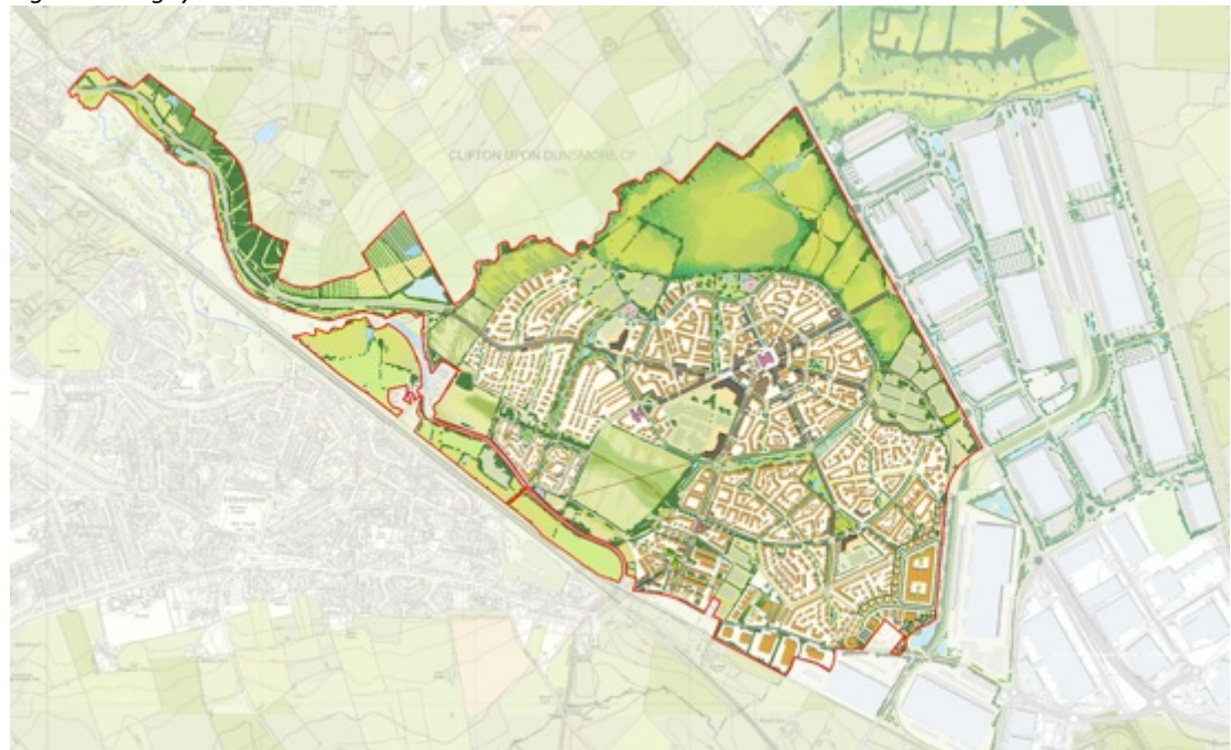
Figure 4: Rugby Radio Station

Mr Lock also discussed some masterplanned sustainable urban extensions designed by his firm that expressed some of the principles applying to eco towns, including the 6,500 home Rugby Radio Station, the ex-airfield of Alconbury Weald in Huntingdonshire with 6,000 homes and 9,000 jobs proposed, and closer to home Birchall Garden Suburb designed for the edge of Welwyn Garden City in a former tip area.