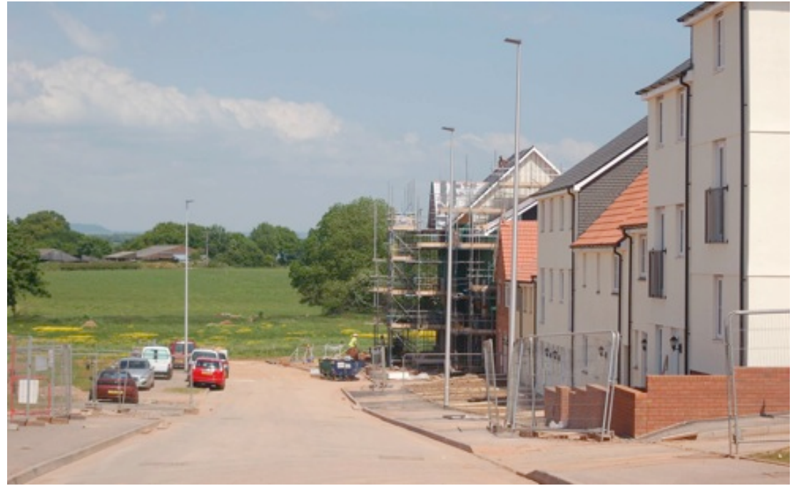
Figure 2: Brooklands