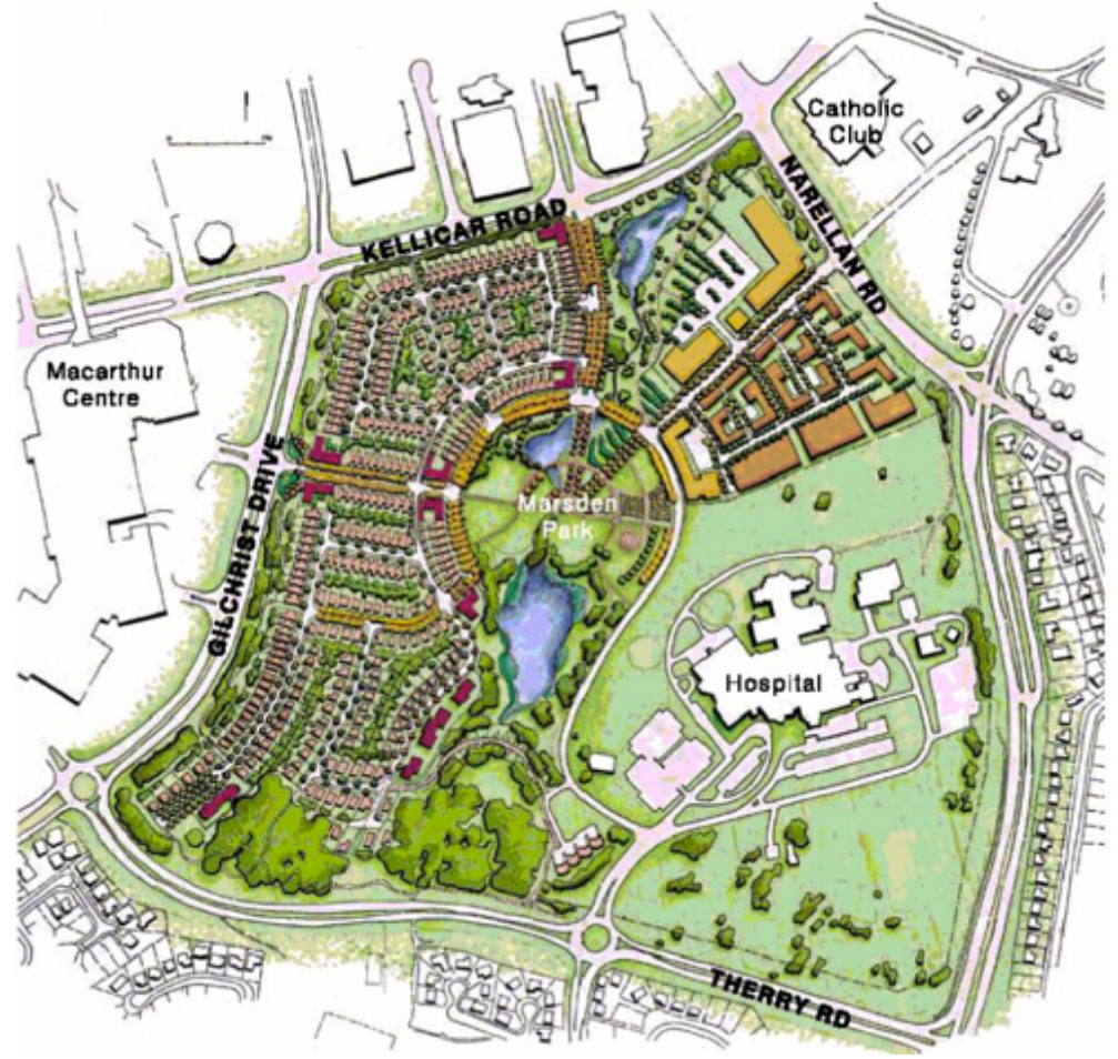
Figure 5 - Park Central Masterplan

The second Sydney based case study meanwhile focused on the inner city site of Jackson's Landing, developed by the private development firm Lend Lease, at Pyrmont, a peninsula of land jutting into Sydney Harbour very close to Circular Quay. Jackson's Landing is configured of 1,339 residential units, 3.2 ha of public space, mixed-use over 11 hectares. Liveability is emphasised, with the development marketed as "[a] place where you will make friends and know your neighbours" (Lend Lease, n.d.: 2)