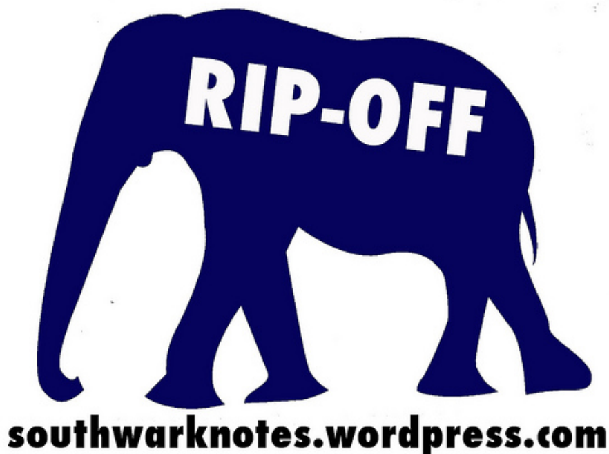
Fig. 3: Southwark Notes & Archives Group. 2014.

Much like other blogs of its ilk, Southwark Notes concerns itself with the politics of transparency – or digital whistle blowing if you will – in the form of the deconstruction of prevailing myths attached to the area. Written by a group of Southwark residents, the site provides frequent updates on the regeneration process as well as video, photographic, and poster tributes to the area. What sets Southwark Notes apart, however, is its strong awareness of the historical roots of this resistance, an appreciation illustrated in its repeated use of the elephant motif [Fig. 3]. Found centred on its namesake road intersection in South London, the original Elephant and Castle statue is symbolic of the area's extensive cultural history and utilized at every opportunity on Southwark Notes to support the idea of historical contiguity and perseverance. The name of the area can be traced back to the 15 th century via its mention in Shakespeare's Twelfth Night , while a large elephant sculpture – not dissimilar to the distinctive emblem attached to the soon to be demolished Elephant and Castle shopping centre – perched atop the entrance to the Elephant and Castle Theatre until the late 19 th century.