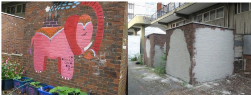
Fig. 4: Southwark Notes & Archives Group. 2014.

Fiona Colley – fiona.colley@southwark.gov.uk