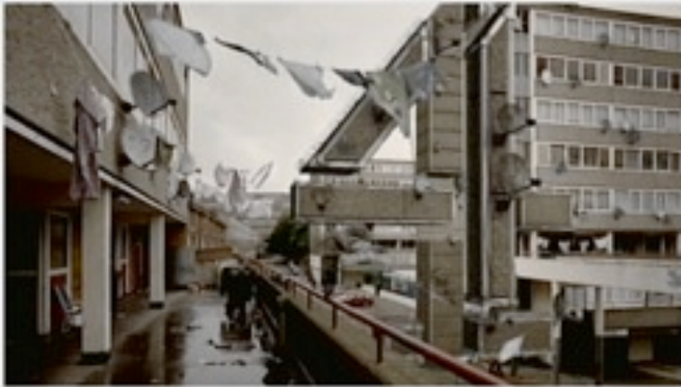
Fig. 1: Channel 4 ident (2004-2013).

Channel 4's use of Heygate as a backdrop for the archetypal "sink" estate in one of its current idents illustrates this dynamic [Fig. 1].