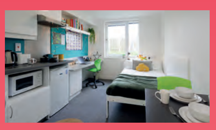
Studio en suite Self-contained College Lane