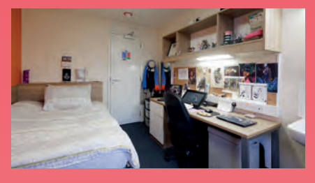
1 double bed College Lane