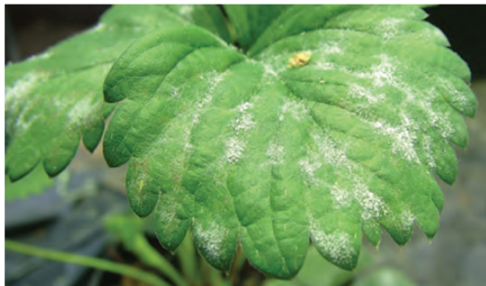
An infected leaf shows the devastating impact of Strawberry Powdery Mildew on plant performance.