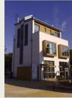
The BRE's innovation park features numerous buildings constructed using environmental design measures and energy-efficient materials (above)