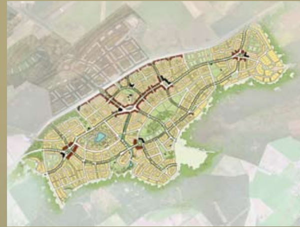
Recent urban design assessments undertaken by DPZ include the planning of the new town of Tornagrain in the Scottish Highlands (below), the hurricane recovery scheme for St Bernard Parish, Louisiana (top right), the regional planning scheme for Onondaga County, New York (bottom right)

DPZ's work has received numerous awards, including two National American Institute of Architects Awards, the Vincent Scully Prize, the Thomas Jefferson Medal and two Governor's Urban Design Awards for Excellence, and most recently, the Richard Driehaus Award for Classical Architecture. The firm has also been widely featured in the media in both the U.S. and the U.K., and has been featured in Newsweek, the New York Times, the Washington Post, and the New Yorker, the Guardian, the Telegraph, the Sunday Times, the Scotsman and the Glasgow Herald.