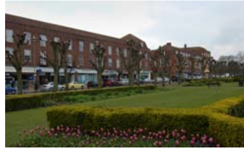
Welwyn Garden City is well-known for its parks and planned public civic spaces

will likely be considered for future development and regeneration. At the charrette, the team will create plans and proposals for these various types of sites, with the materials ultimately useful for Councils, Planning Authorities and developers across the County. Specifically, the design team will generate sustainable development approaches for