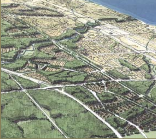
DPZ's recent urban planning initiatives in North America include the regional growth plan for Oakville, in Ontario, Canada (above)

The New Urban principles of planning and design were developed under the leadership of Duany Plater-Zyberk, and are aligned with many of the strategies advocated by environmental agencies such as the U.S. Green Building Council and the Building Research Establishment. Specifically, DPZ's projects employ sustainable development strategies including, but not limited to, redevelopment and infill; transit-oriented development; pedestrian-friendly development; and the integration of development with open-space frameworks. DPZ has also been involved in the development and fine-tuning of the first and only environmental design and performance standard for neighbourhood development in the United States.