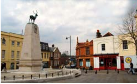
Hertford's Parliament Square functions as a community gathering space in the heart of the commercial centre