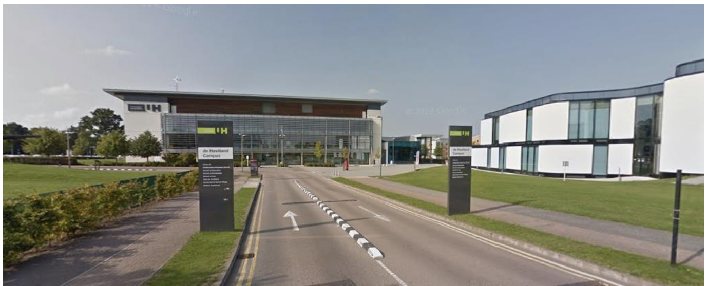
De-Havilland entrance, University of Hertfordshire